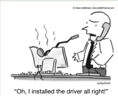
“Oh, I installed the driver all right!”